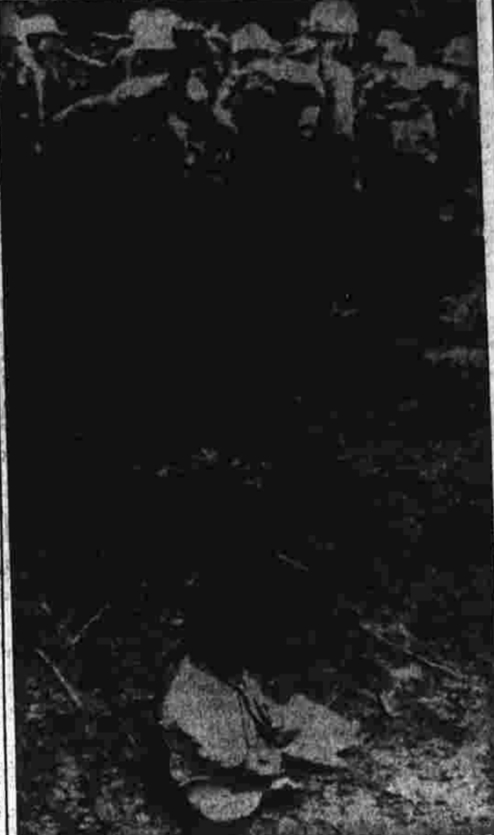
This little Vietnamese girl sits alone on the ground as Viet Marines scour the area near the village of Boun Khong in search of Montagnards (mountain people). The expedition captured 17 Montagnards, a group favoring autonomy for the central Viet Nam highlands.