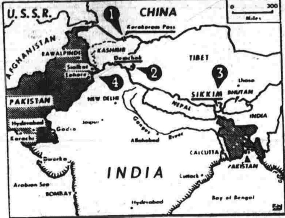
India has charged Communist China has troops in position at three points on its border (1, 2, 3). Meanwhile Pakistan reports its forces have beaten back an attack today near Sialkot (4).